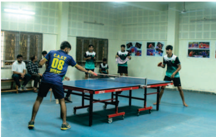
Table Tennis Event