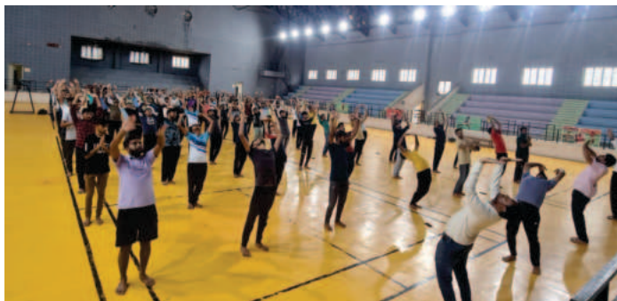
Pre-practice of Yoga by Volunteers