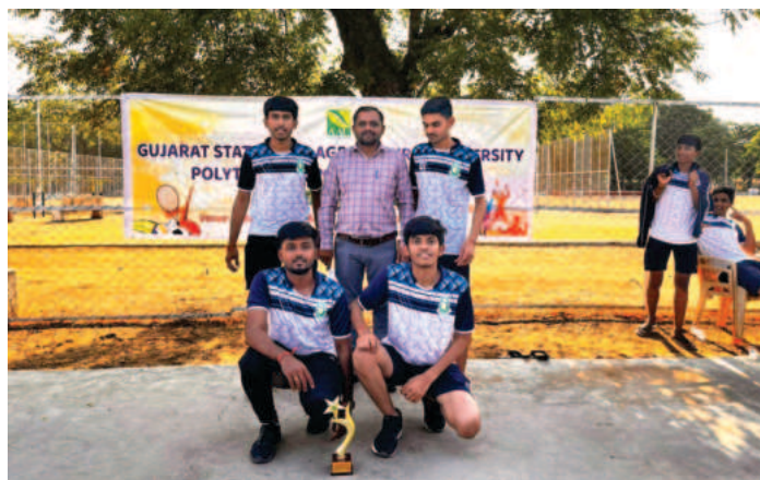
Badminton (Boys) Runners-up (Polytechnic)