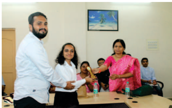
Winners of Debate Competition