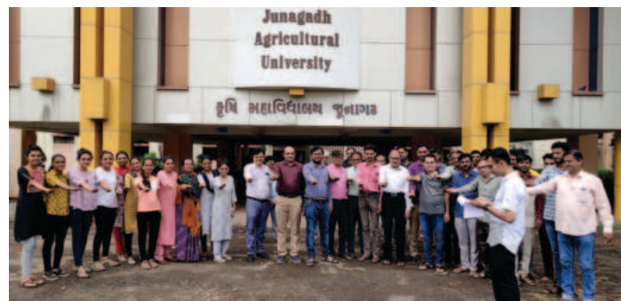
Pledge taken by Volunteers and Staff Members