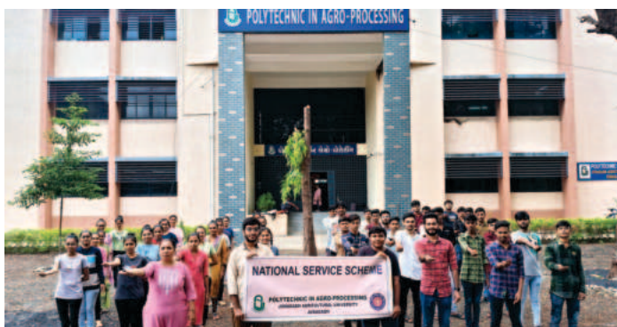
Pledge taken by NSS volunteer