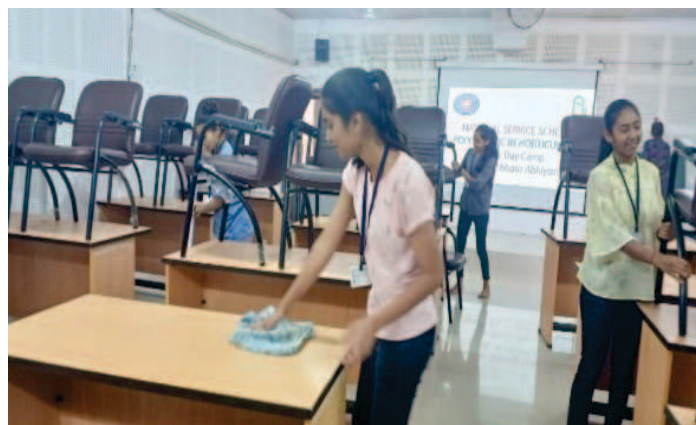
Cleaning of Classroom and Laboratory

NSS unit, Polytechnic in Horticulture, JAU, Junagadh conducted a cleanliness programme near its building, laboratories and farm on 16th March, 2024. Total of 100 students and 10 faculty members joined the campaign keenly.