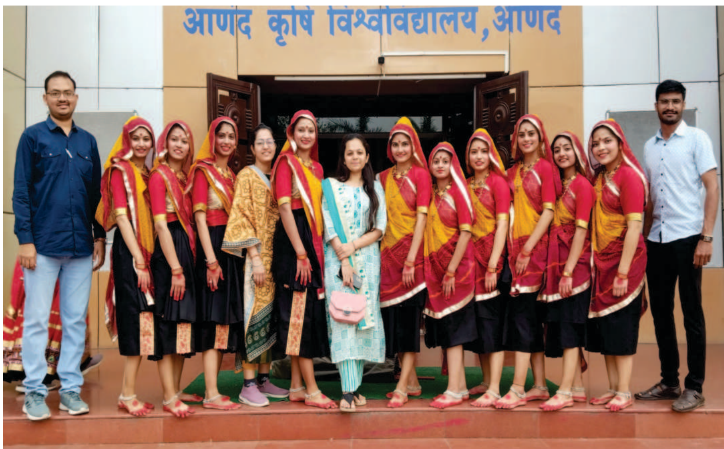
JAU team for Cultural-Literary Events