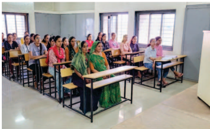
Polytechnic Girls & Farm Labourers attending the Lecture on Mahila Sashaktikaran

One day seminar on “Woman protection and Mahila Sashaktikaran” was organized on 08/03/2024. Total 23 Girls students and 5 Farm women labourers attended this seminar.