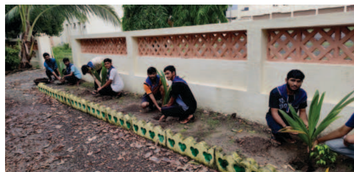
'Tree Plantation' under Meri Mitti Mera Desh Campaign

Tree plantation program was organized under 'Meri Mitti Mera Desh' campaign during the Azadi ka Amrit Mahotsav. NSS volunteer, staff member participated in this event.