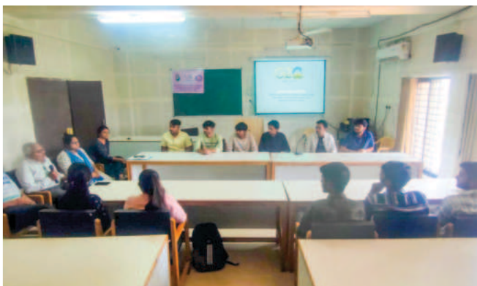
Students participating in Group Discussion