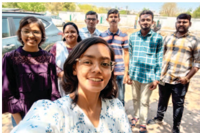
JAU Campus Team for Audition at DD Girnar, Rajkot