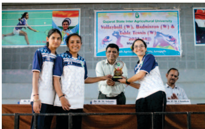
Badminton (Girls) Champions