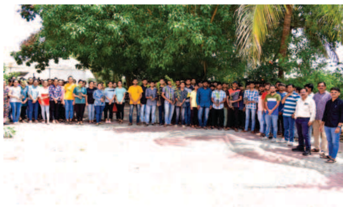
Excerpts from Celebration of ‘World Environment Day’

Celebration of World Environment Day was carried out by doing Tree plantation by staff members and students enthusiastically. They were asked to plant a sapling to create a green corner. A lot of enthusiasm was seen in the students. The event was conducted successfully with whole hearted participation and awareness about plants.