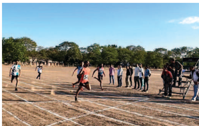
100 mt. Race (M) Event