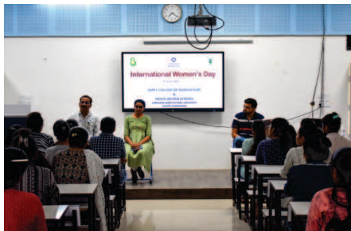
Glimpses from Celebration of International Women's Day

International Women's Day (IWD) is celebrated globally on 8 th March each year to commemorate the social, economic, cultural, and political achievements of women. It is also a day to raise awareness about gender equality and advocate for women's rights. The International Women's Day celebration in 2024 at ASPEE College of Agriculture JAU Khapat was a vibrant and empowering event that honoured the contributions of women and called for continued progress towards gender parity.