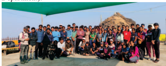
Excerpts from 'Plastic Collection Drive'

A plastic collection drive was conducted by 4th Semester B. Tech (Agril. Engg.) NSS volunteers on 17th March, 2024 from Ambaji to Datatreya (stairs) on behalf of “Plastic Free Girnar Eco-Sensitive Zone” Campaign with permission and guidance from the Junagadh Division, Junagadh (Gujarat State Forest Department).