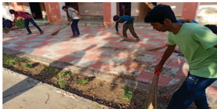
Students participating in Swachhata hi Seva Abhiyaan

NSS volunteers and staff members of Polytechnic in Agriculture, JAU, Halvad participated in “Swachhata hi seva Abhiyan”. All NSS volunteers and staffs are enthusiastically joined for clean activity and cleaned the campus ground, hostel compound, lobby, terrace and also area around polytechnic building.