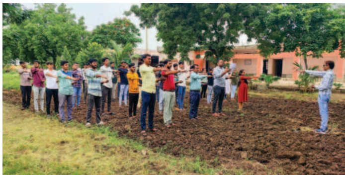
Panch Pran Pratigya under Meri Mitti Mera Desh Programme