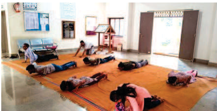
Practice session of Surya Namaskar

As a part of celebration of World Yoga Day, practice session of Surya Namaskar was organized by Polytechnic in Horticulture, JAU, Junagadh on 17 th June 2023. Total 8 staff members and 40 students participated enthusiastically.