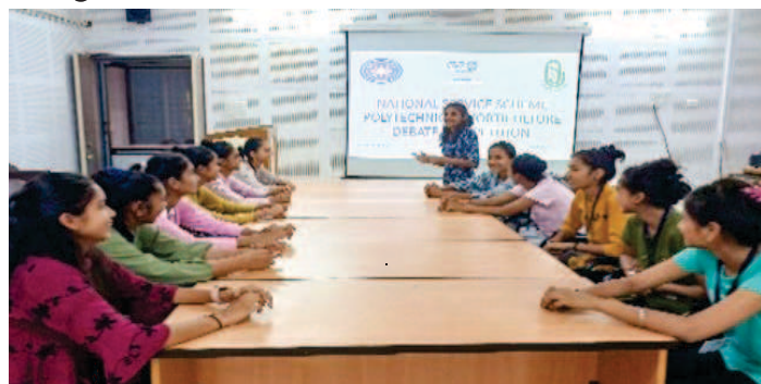
Students participating in Debate on Disaster Risk Management