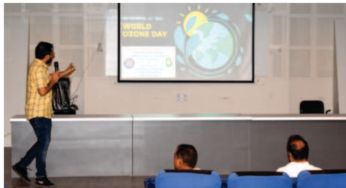
Excerpts from Workshop on World Ozone Day

On the occasion of World Ozone Day, the College of Agriculture JAU Porbandar organized a workshop aimed at raising awareness about the importance of preserving the ozone layer and promoting sustainable practices in agriculture. The celebrations were held on September 16, 2023, with enthusiastic participation from students and faculty.