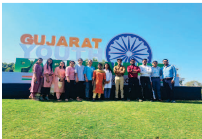
Team of 13 JAU students at Mahatma Mandir, Gandhinagar for Youth Parliament