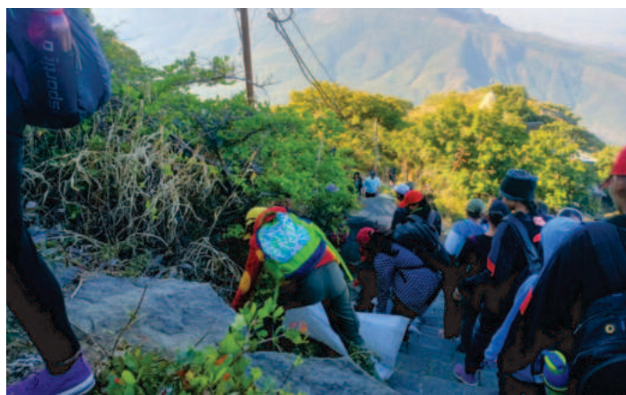
Few Excerpts of Basic Rock Climbing