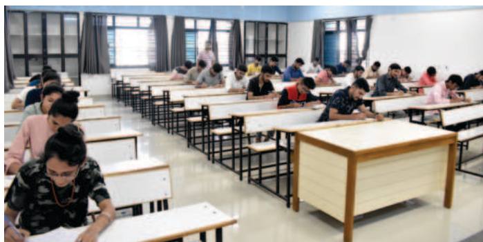
Students participating in Essay Writing

Celebration of Indian independence under Azadi Ka Amrit Mahotsav at COA, JAU, Khapat. In this programme Essay, Debate and Drawing competitions were organized and 15 students actively participated in this programme.