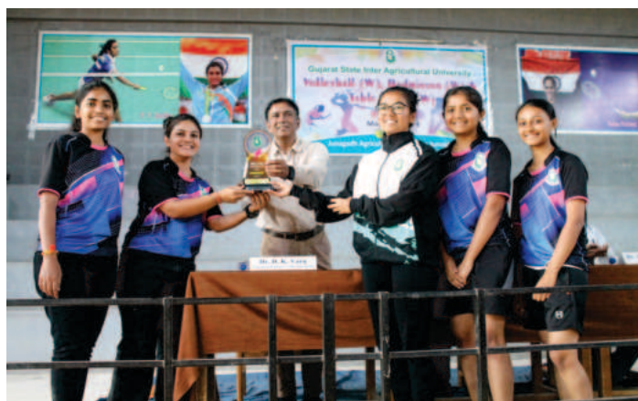
Table Tennis (Girls) Champions