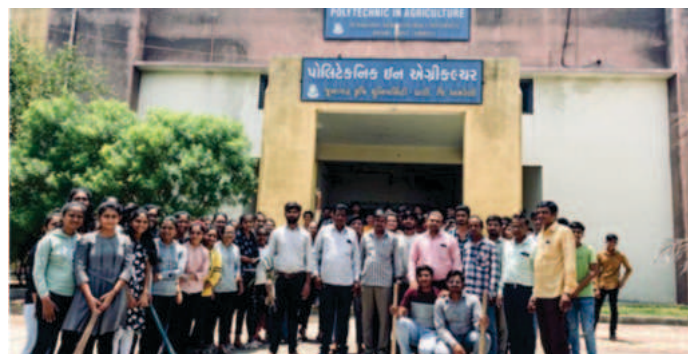
Plantation of trees by Polytechnic Staff and Students during World Environment Day