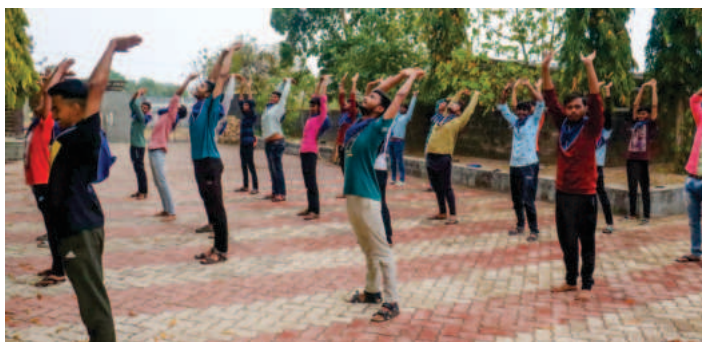
Students performing Yoga Poses on International Day of Yoga