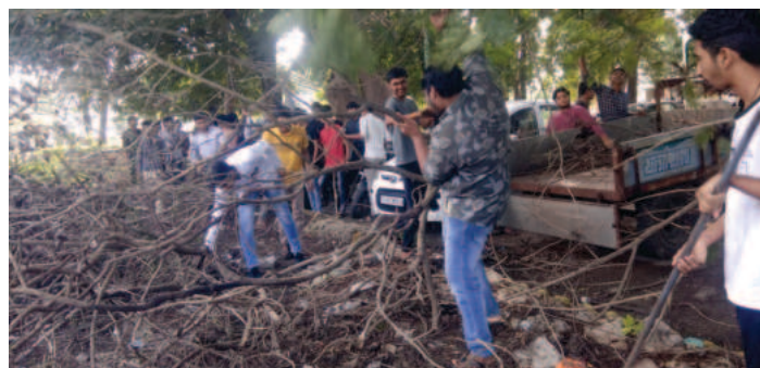
Swachhata Abhiyan and Health Awareness Camp at Sports Complex JAU

Program on Swachhata abhiyan and health awareness was organized at Sports complex of Junagadh Agricultural University. Program was organized by College of Agriculture, JAU, Junagadh. NSS volunteers and program officer participated in this program.