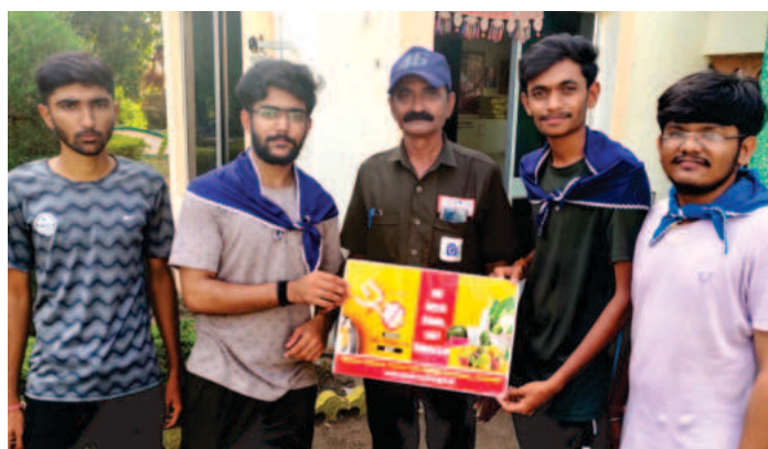
Awareness Campaign to Stop Using Tobacco on 'World No Tobacco Day'