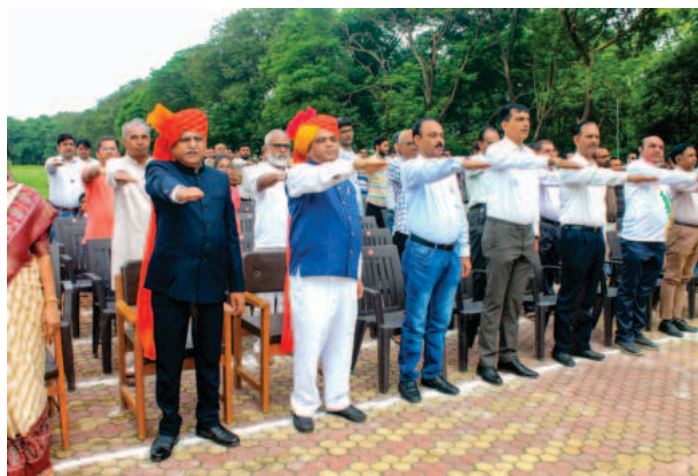
University Officers taking Panch Pran Pratigya