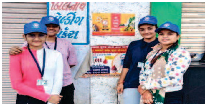
NSS volunteers spreading Awareness about Ill Effects of Tobacco

NSS unit of Polytechnic in Horticulture, JAU, Junagadh celebrated world no tobacco day on 31 st April, 2023. On this day total of 12 students were actively participated in the activity and create awareness about the ill effects of tobacco, its causes and the preventable measures, and also, they draw attention of a people to the tobacco epidemic and the preventable death and disease it causes at residential and commercial area of the Junagadh city.