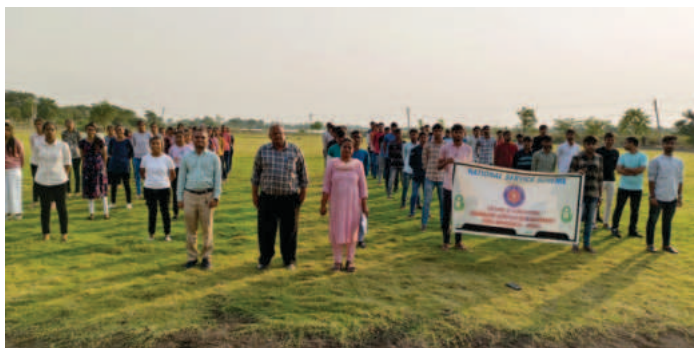
Students & Staff taking Oath