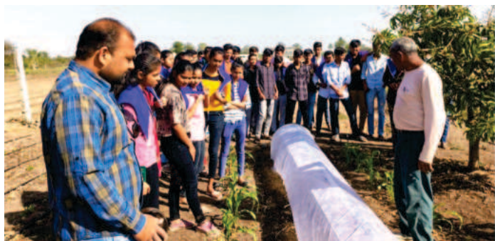
Visit to Progressive Farmer