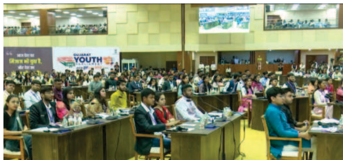
Two students of JAU in 2 nd and 3 rd rows as youth parliament ministers