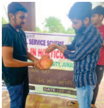
Holding Mitti in Hand and Putting Mitti in Earthen Pot during 'Panch Pran Pratigya'