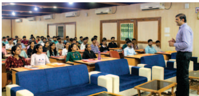
Training on “Ignite your Inner Spark”