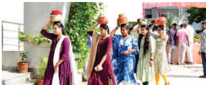
Amrit Kalash Yatra

Meri Mitti Mera Desh Amrit Kalash Yatra was organized at ASPEE COA, J.A.U., Khapat-Porbandar along with district panchayat on 18.10.2023. The event aimed to commemorate the richness of Indian soil and its vital role in agriculture, emphasizing the need for conservation and sustainable farming practices. The primary objective of the "Amrit Kalash Yatra" was to raise awareness about the importance of soil conservation, sustainable agricultural practices, and the preservation of traditional farming techniques. It sought to inspire farmers, students, and the community to value and protect the agricultural heritage of India. The event commenced at 9:00 AM with an inaugural ceremony graced by dignitaries from the district panchayat, agricultural experts, faculty members and enthusiastic participants. The "Amrit Kalash Yatra" featured a procession with decorated carts carrying earthen pots filled with fertile soil from different parts of the region, symbolizing the diversity and richness of the soil.