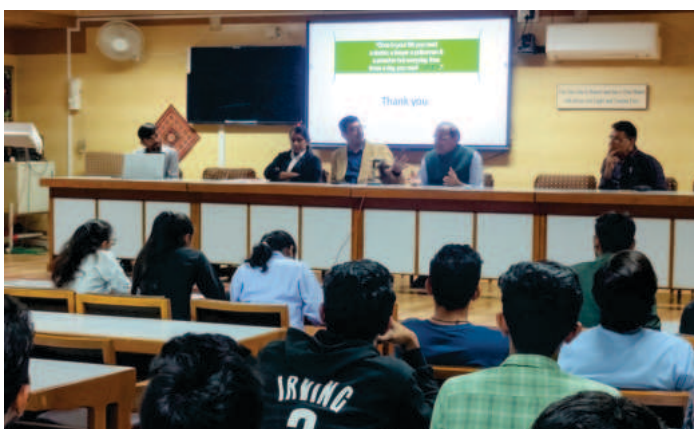
Orientation Programme at CAET, Junagadh by Bhoomi Agro