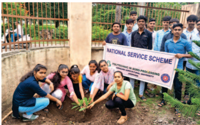
Tree Planted in Polytechnic Compound