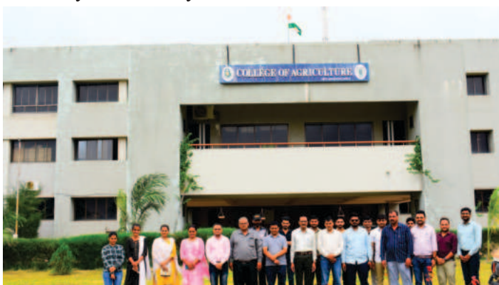
Celebrating Har Ghar Tiranga

Regarding the above subject, it is to inform you that under NSS Unit of the college, the Har Ghar Tiranga Day was celebrated on 14.08.2023. In which the principal and entire staff of College of Agriculture, Mota Bhandaria (Amreli) were involved. They took the oath to work in the development of country with full sincerity and honesty.