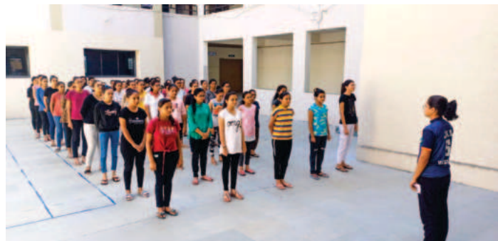
Oath Taking at College & Hostel

NSS officer, physical instructor and other staff members facilitated and arranged the celebration of this day in the college premises. Physical instructor conveyed the message that why this day is being celebrated and told the history behind celebrating this day to the students. It was a successful programme with help of students and staff.