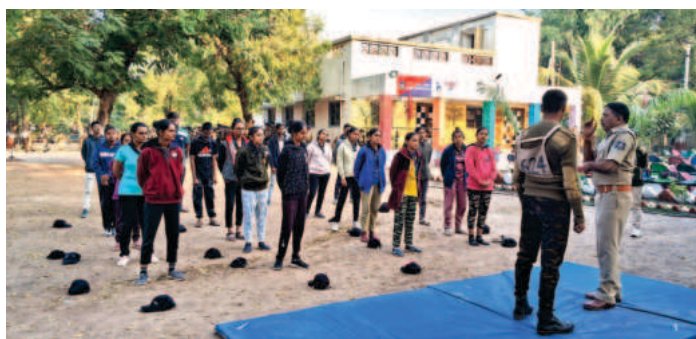
Training by SRPTC