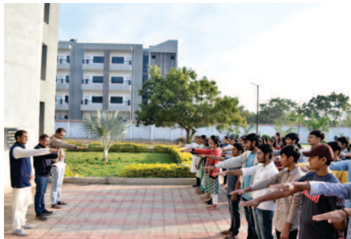
Excerpts from Celebration of National Voter's Day

The Sexual Harassment Prevention Seminar held during the designated week aimed to raise awareness and provide education on preventing sexual harassment in the workplace. Organized by ASPEE College of Agriculture, JAU, Khapat. The seminar brought together employees, employers, human resources professionals, and legal experts to address the issue and foster a safer work environment.