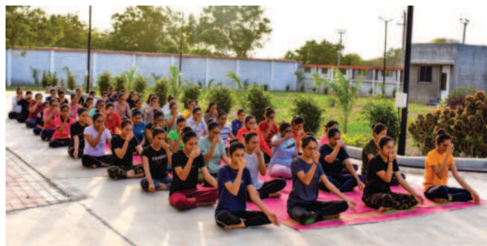
Students attending Awareness Programme

Celebration of International Yoga Day at COA, J.A.U., Khapat-Porbandar. 9 th International Yoga day was celebrated by the students and the teachers of College of Agriculture, JAU, Khapat-Porbandar on 21 st June 2023 with great enthusiasm. Yoga Day is celebrated among the youth to make them understand the importance of Yoga in their life. It helps the students understand how to maintain harmony between body and mind.