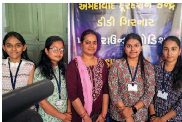
JAU Team of COA, Mota Bhandariya for Audition at DD Girnar, Rajkot