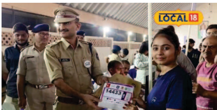
Excerpt of the event 'Run for Junagadh'

A celebratory event was held at the primary branch of the Junagadh police station office, which was attended by both students and staff. The event was organized to commemorate a particular occasion and was attended by a significant number of participants. Such events provide an opportunity for members of the community to interact with the law enforcement authorities and to foster a spirit of cooperation and mutual understanding. The presence of students at the event highlights the importance of educating young people about the role of law enforcement and the importance of maintaining law and order in society. Overall, the event was a success and served to strengthen the bond between the police and the community, culture and moral values in society.