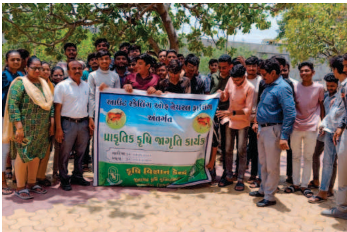
Lecture on “Natural Farming Awareness Programme” at KVK, Targhadia