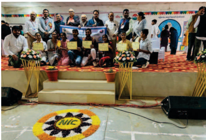
National Integration Camp

07 days' National Integration Camp was held in Nutan Gram Vidyapith of Village Thava, Ta- Netrang, Distt.- Bharuch from 16 th to 22 nd December 2023. 09 students of College of Horticulture went to participate in the camp. During the camp, our students were deeply involved and actively participated in the different workshops held in the morning, first half of each day and group discussions in the second half on topics, viz., doubling the farmer's income, importance of panch gavya, natural resources, rural to urban and urban to rural migration. Various lectures in the afternoon, i.e., first half academic session were arranged like natural farming, plant protection, millets, value addition of natural farming products etc. In the second half of the afternoon sessions each day so many activities and competitions were also held like group dance, poster competition, traditional attire, rangoli. This type of exposure is much needed for the students to prepare better for future.