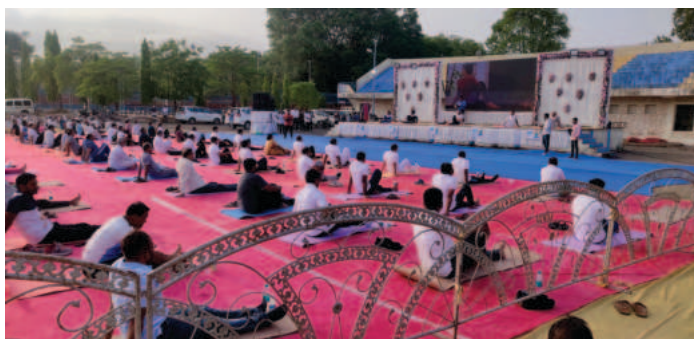
Celebration of “International Yoga Day

Celebration of “International Yoga Day-2023”. In this yoga day, NSS Volunteers participated in this Program. This program is organized by sports, youth and cultural activities department, Gandhinagar and Junagadh Agricultural University, Junagadh.