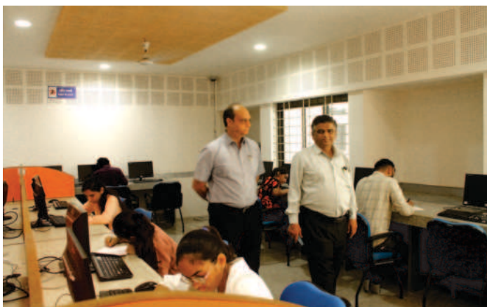
Essay Writing Competition