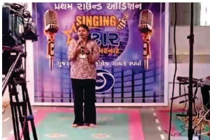
Student Performing in Audition at DD Girnar, Rajkot