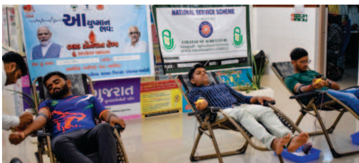
Excerpts from Blood Donation Camp