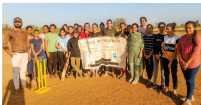
Girls Cricket Tournament during National Sports Day

Inter-semester sports tournaments were arranged during National Sports Day-29/08/2023. Girls Cricket Tournaments, Running, kho-kho, Limbu chamchi, Badminton, T-T, etc. games were arranged.