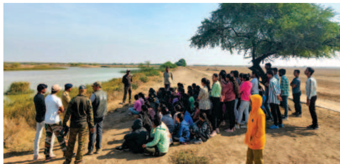
Field Visit to “Velavadar Blackbuck National Park”