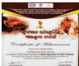
Shield & Certificate of the Winner Student