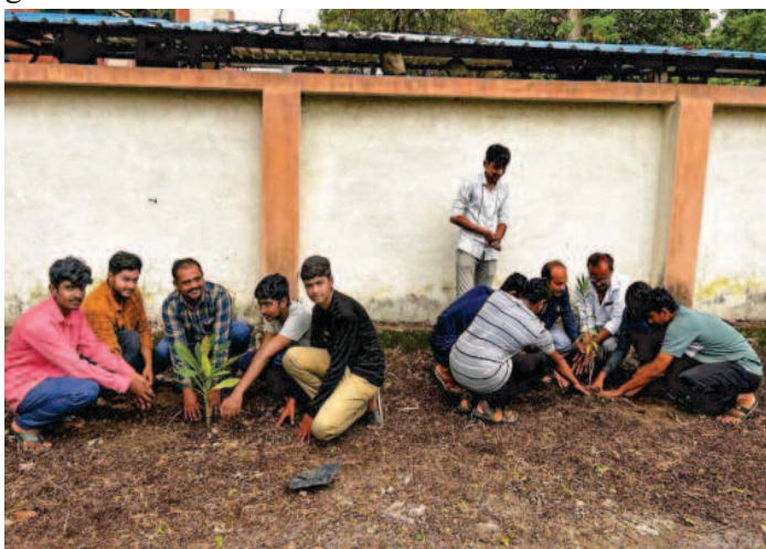
Students participating in Tree Plantation

A tree plantation programme was organized as a part of the 'Meri Mitti Mera Desh' campaign during the Amrit Mahotsav celebration. Program was organized at Polytechnic in Agriculture, JAU, Sidsar, Junagadh. A total of 16 saplings were planted near the college building. NSS volunteers and staff members participated in this initiative, contributing to the greener environment.