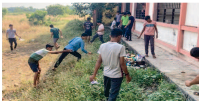
Cleaning of Hostel Periphery

Different activities like Plastic free campus, cleaning of sports ground, cleaning around the hostel periphery area etc. under SHS Campaign were conducted for NSS volunteers during 15/09/2023 to 02/10/2023.