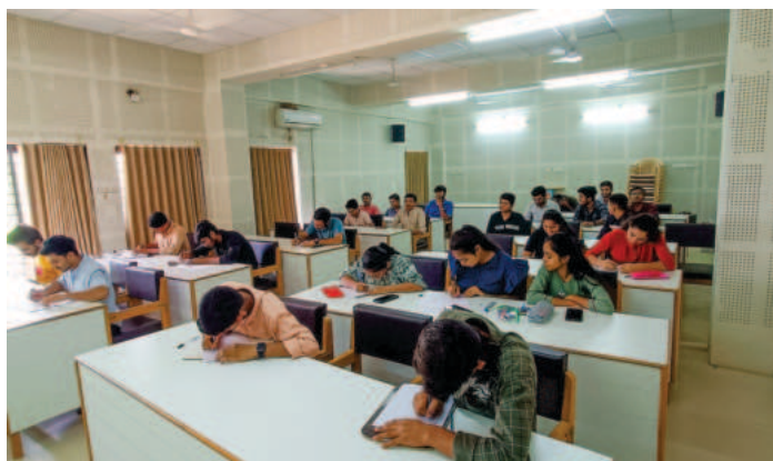
Students participating in Essay & Slogan Writing Competition