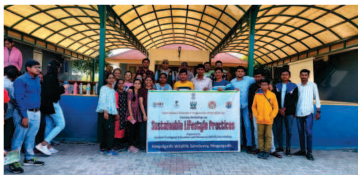
Students attending Training Programme on “Sustainable Lifestyle Practices”