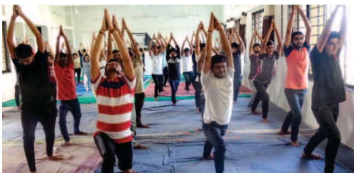
Meditation, Yoga and Naturopathy Camp

am. Second session was orientation lecture on Naturopathy and well-being of individual life. This session was started from 10:00am to 11:00 am. Third session was interaction and question answer session related to depression, anxiety, dilemma, emotional outburst and many more mental and spiritual well-being related questions. This was 2:30 hrs. session, started from 11:00 am and end up to 1:30 pm. This was a wonderful programme arranged by the college staff, NSS officer, Physical instructor, SRC Chairman.