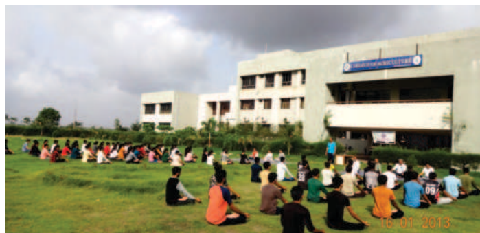
Celebration of International Yoga Day

International Yoga Day was celebrated on 21.06.2023 by the NSS officer /staff and students under the National Service Scheme at College of Agriculture, Mota Bhandaria. A total of 146 NSS volunteers participated in the International Yoga Day.