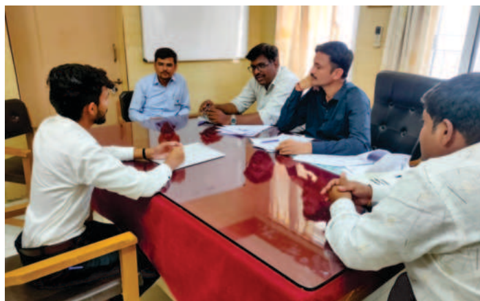
Personal Interview at CAET, Junagadh for Kothari Group