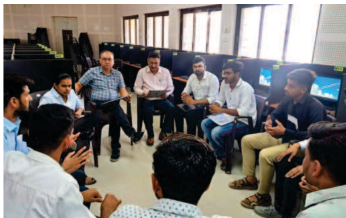
Group Discussion held by Gharda Chemical Ltd.