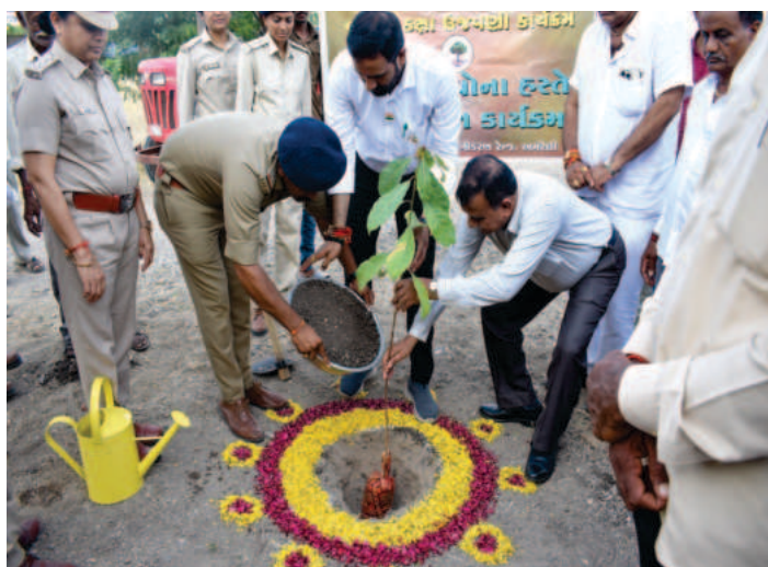
Celebrating Van Mahotsav