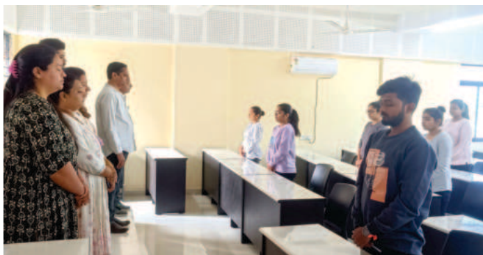
Two Minute Silence in Class Room

In our college, all NSS volunteers and faculty members stood on their positions and observed silence for two minutes from 10:59 am to 11 am on January 30, 2024 on the occasion of the celebration of Martyr's day.