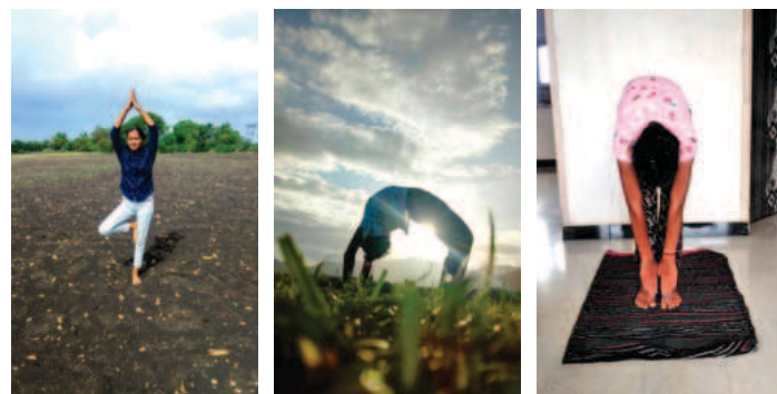
Students doing Yoga Poses