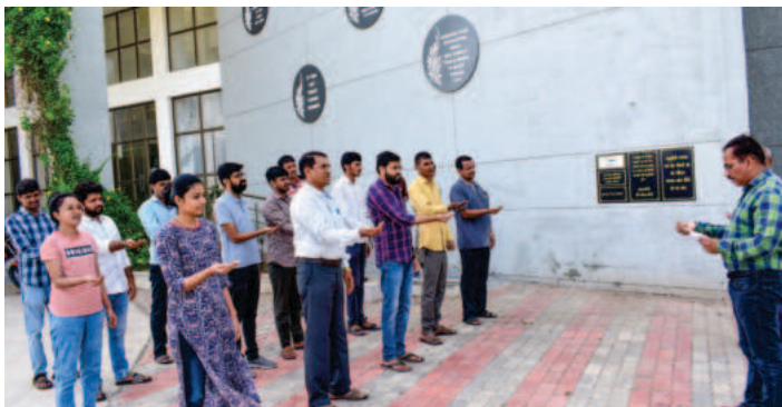
Programme on Meri Mitti Mera Desh