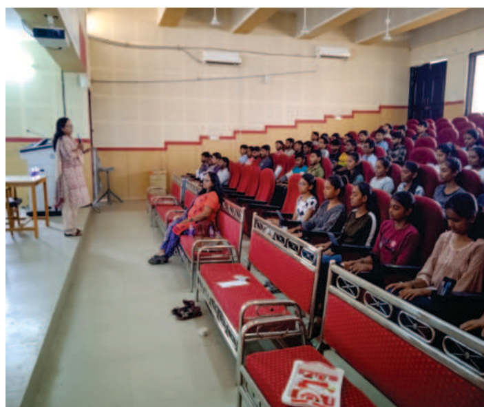
Lecture on Stress Management