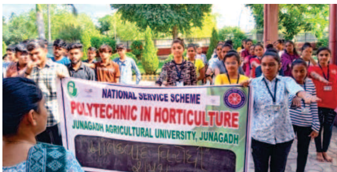
NSS volunteers taking pledge of “Anti-Terrorism”