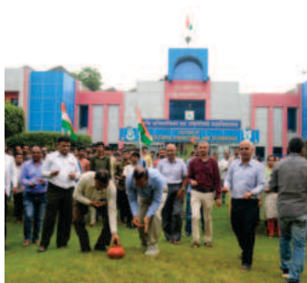
Oath Taking Ceremony