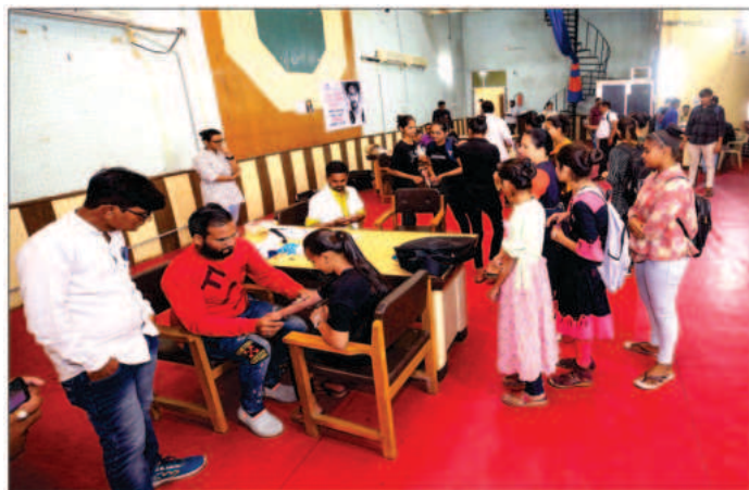
Thalassemia Screening Camp