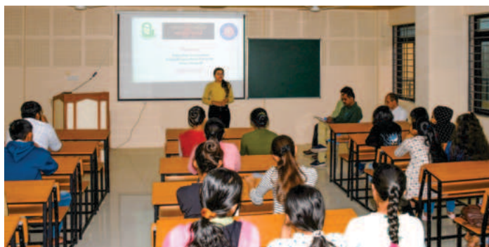
Gujarat Sanskrutik Vakrutva Spardha at College Level