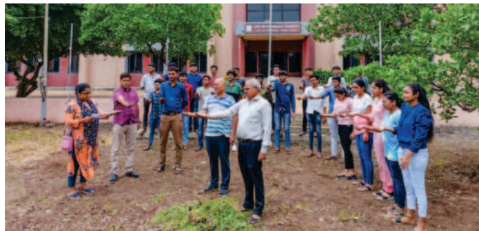
Staff and Students taking Panch Pran Pratigya