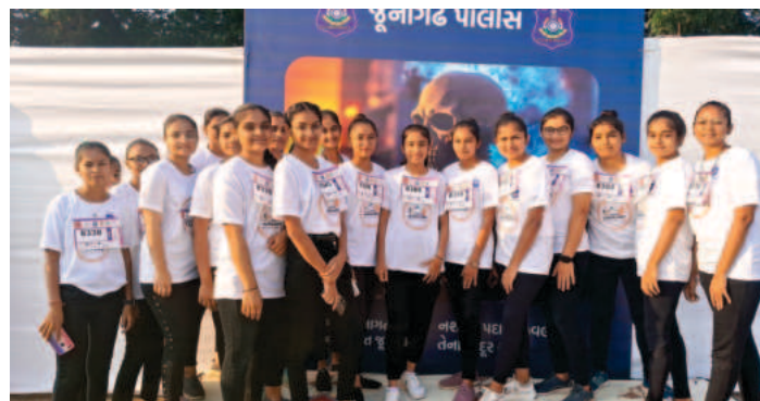
NSS Volunteers at Sports Ground of JAU, Junagadh

Run for Junagadh was organised by Junagadh Police in collaboration with DSW, JAU, Junagadh. In this event NSS volunteers of Polytechnic in Agro Processing participated.