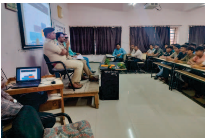
Students attending the Seminar on Cyber Crime Awareness