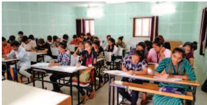
Students participating in Essay Writing Competition