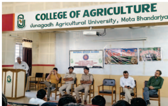
Awareness Program on Environment Protection

One day awareness programme on “Environment Protection”, which has been organized by NSS unit of the College of Agriculture, Mota Bhandariya, J.A.U. on 29.02.2024 in college auditorium. The lecture was delivered by Amreli district, Forest Range Officer on the topic of importance of forest, trees and environment in our life. The final years students participated in this event.