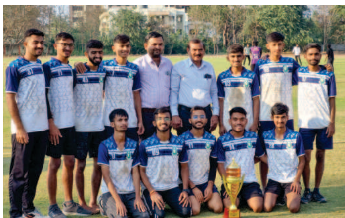
Kho-Kho (Boys) Champions