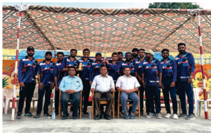
Champion Team of the Tournament with Hon'ble Vice Chancellor and DSW