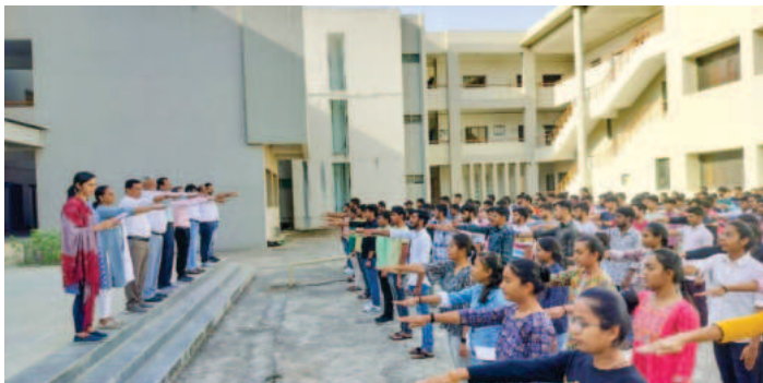
Students taking Oath on National Voter's Day

National Voter's Day was celebrated on 24th January, 2024 in the college of Agriculture, Mota Bhandariya. All the staff including Principal, SRC Chairmen and 68 students participated in this event and took the oath for valuable use of their voting right.