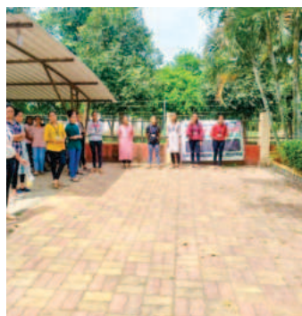
Lemon Race Among Student