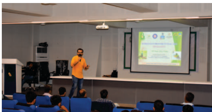
Students attending Awareness Programme