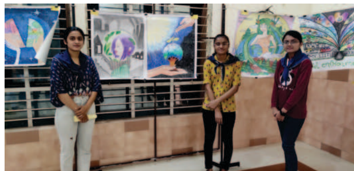
Volunteers Participating in Poster Competition