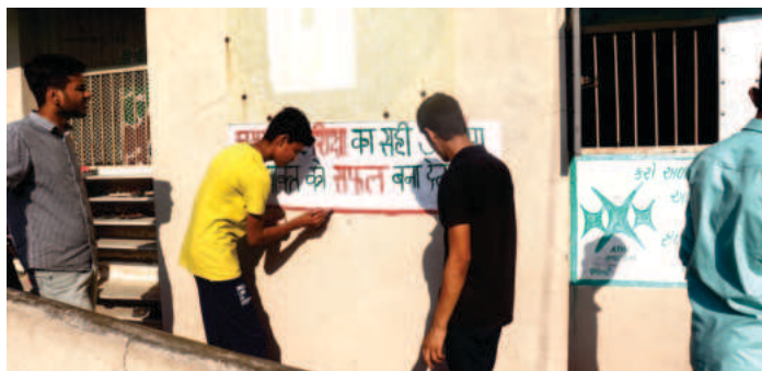
Writing Slogans on Wall of Primary School