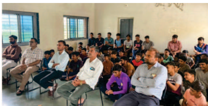
Webinar on Technology Development and Digital Awareness

Online quiz competition was organized on 'Indian Freedom Fighter and Histories of India' under May Month Activities. There were total 72 students participated in this quiz. One webinar was also organized on Technology Development and Digital Awareness.