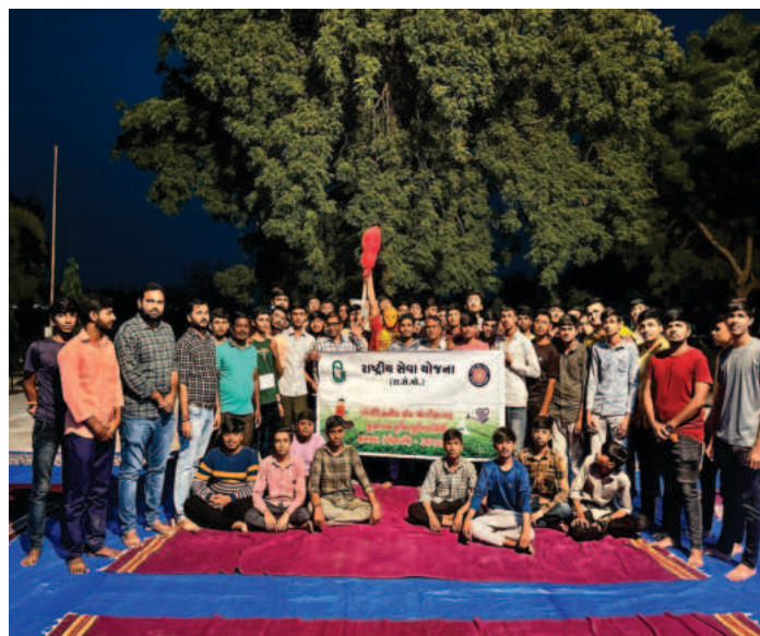
Akhand Dhun & Hanuman Chalisa at PIA, JAU, Halvad

At this polytechnic cultural event of Akhand Dhun and Hanuman Chalisa was organized. In event students, staff members and other peoples were joined and pray for global peace by means of akhand dhun and hanuman chalisa. Praying was done from morning to evening (12 hours).