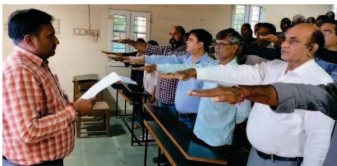
Unity Pledge taken on National Unity Day

Unity pledge was taken under celebration of National Unity Day in College of Agriculture. This pledge was taken by National Service Scheme (NSS) volunteers and staff on National Unity Day which denotes significant commitment to promoting unity, integrity, and harmony within society.