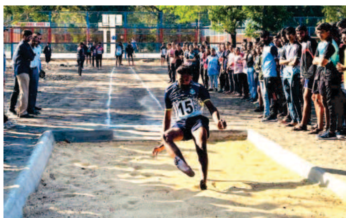
Long Jump Event