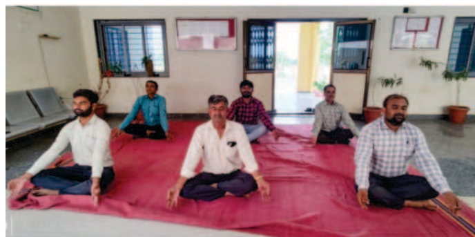
International Yoga Day Celebration by Polytechnic Staff

Surya-namaskar and different yoga asanas were done by staff as practice session, as part of International Yoga Day. Total 05 Staff and 49 students were registered on Yoga Day Registration Portal.