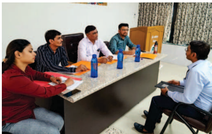
Personal Interview by GATL, Vadodara