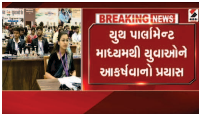
JAU student shown up in You tube Sandesh News