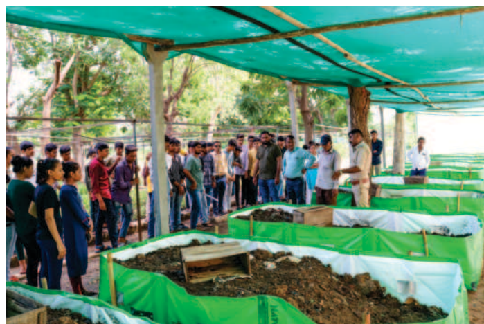
One Day Camp on Nature and Environment Conservation at Ratakdi

Halvad. In camp RFO Jambucha madam delivered her lecture on “Importance of Environment Conservation” to volunteers. After this, all volunteers had taken visit to nursery and obtained different information of forest trees, propagation techniques and vermicompost etc. At the end of camp all students had given assurance for LIFE (Lifestyle for Environment).