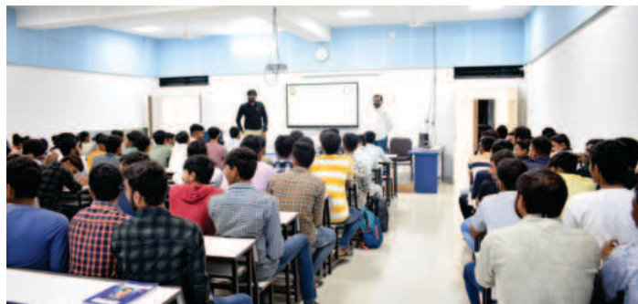
Students attending the One-day Seminar

On 15 th March 2024, a one-day seminar on "Natural Farming: New Direction in Indian Agriculture" was organized at ASPEE College of Agriculture JAU Khapat. The seminar aimed to explore the principles and practices of natural farming and its potential to revolutionize Indian agriculture towards sustainability, environmental conservation, and improved livelihoods for farmers.