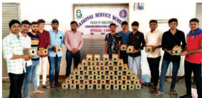
Distribution of Bird Nest