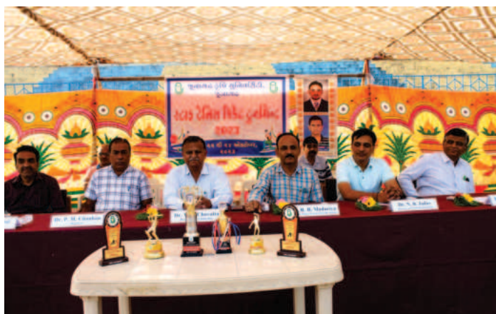
University Officials present in Opening Ceremony of Staff Cricket Tournament