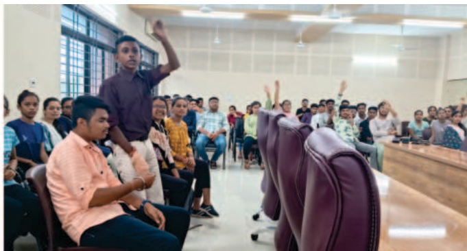
Special lecture at seminar hall of Poly.in Agro.Proc.