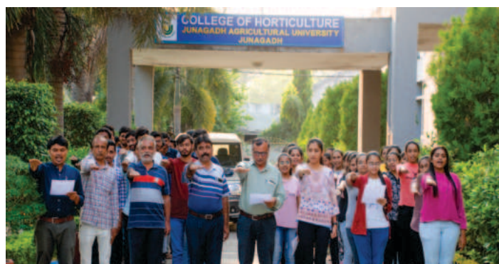
Voter's Day Pledge Taking Ceremony