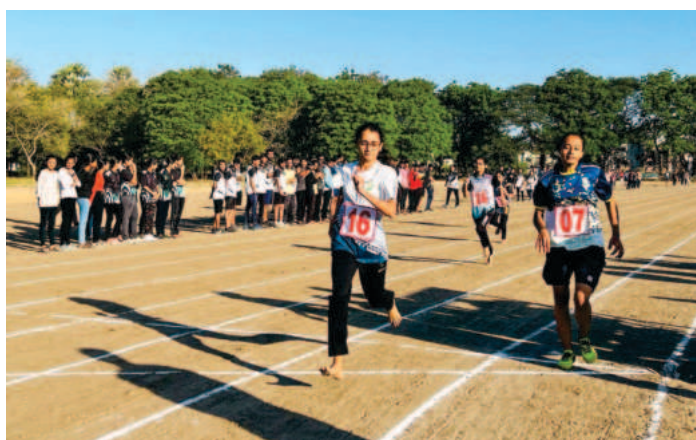
100 mt. Race (F) Event