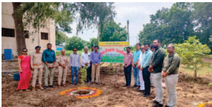
Celebration of 74 th Van Mahotsav at Halvad

A taluka level 74 th Van Mahotsav was celebrated at this polytechnic with collaboration of Social Forestry Dept., Halvad. In Van Mahotsav event various dignitaries as Mamlatdar, APMC chairman, RFO joined and view their idea on that event. At last all dignitaries were planted various forest trees in compound area of polytechnic and plants were distributed to students and beneficiaries.