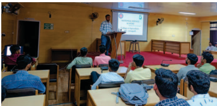
Excerpts from NSS Orientation Program

NSS orientation program was organized by College of Agriculture, JAU, Junagadh. NSS volunteer and program officer participated in this program. Program officer explained about the event and activities carried out under NSS to the NSS volunteer of first year.