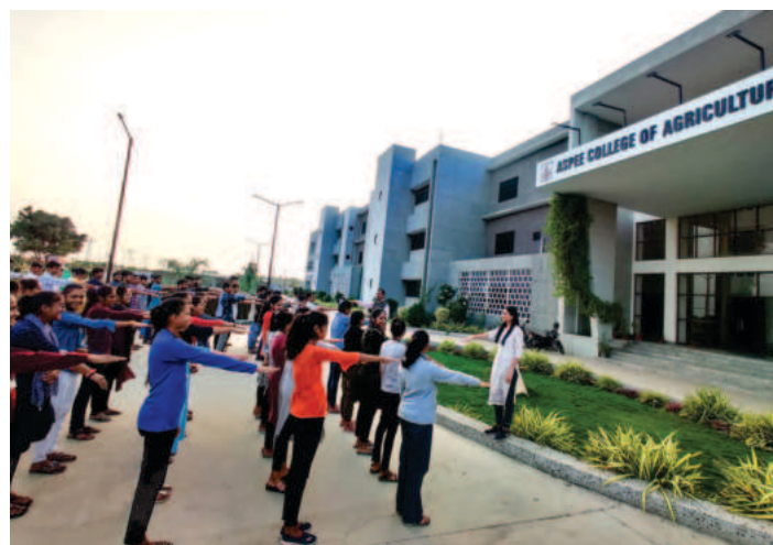
Pledge taking on the occasion of 'World AIDS Day'

Observation of World AIDS Day 2023 at ASPEE COA, J.A.U., Khapat. ASPEE College of Agriculture (COA), Junagadh Agricultural University (J.A.U.), Khapat- Porbandar, observed World AIDS Day on December 1, 2023. The event aimed to raise awareness, reduce stigma, and educate the campus community about HIV/AIDS, emphasizing prevention, treatment, and support for those affected by the disease. All the students and faculty members taken a pledge regarding awareness about HIV/AIDS.