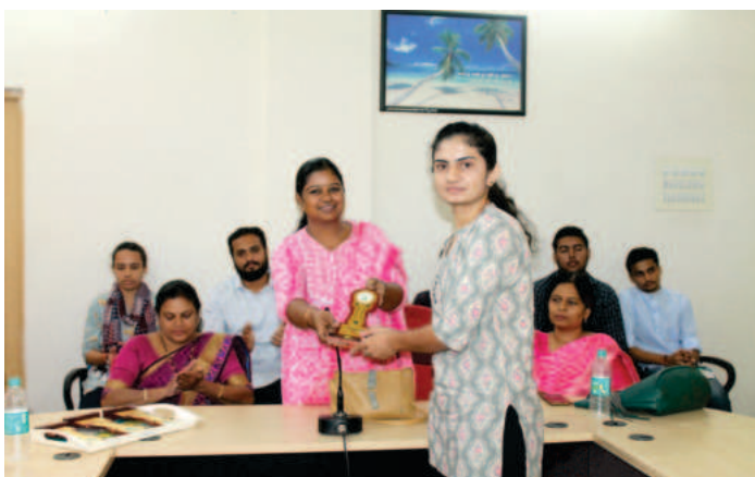
Students Receiving Awards in Debate Competition