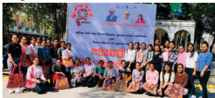
NSS Volunteers participated in International Women's Day

NSS girls' volunteers of Polytechnic in Agriculture, JAU, Sidsar, Junagadh actively participated in the celebration of International Women's Day at Auditorium, JAU Campus organized by Department of Women and Child Development, Government of Gujarat, Gandhinagar and District Administration Junagadh.