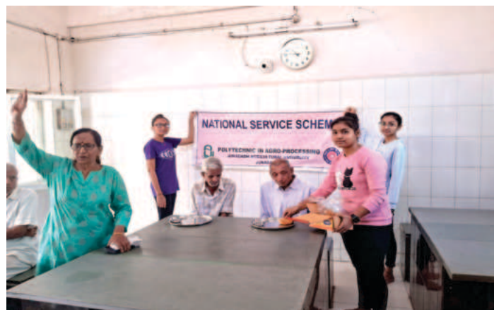
Food served by NSS Volunteers at Niketan Old Home, Jail Road, Junagadh

NSS volunteers celebrate 31 st December in Niketan old home, Junagadh. They have cleaned surroundings, and watered plants grown there. They served food and also took lunch with them so alone old living people felt happy.