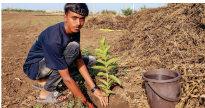
Student Planting Tree at Native