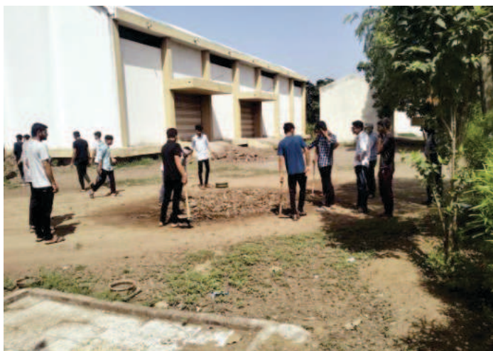
Students Participating in Cleanliness Drive