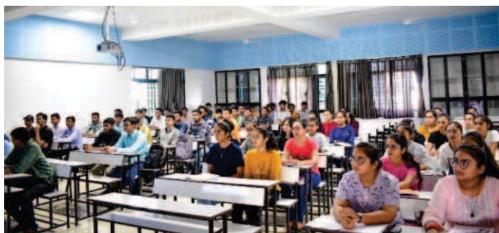
Students Virtually attending Western Zone Vice-Chancellors' Conclave

Western Zone Vice-Chancellors' Conclave was virtually organized at ASPEE COA, J.A.U., Khapat-Porbandar on 26 th October 2023. ASPEE College of Agriculture (COA), Junagadh Agricultural University (J.A.U.), Khapat-Porbandar, hosted the esteemed Western Zone Vice-Chancellors' Conclave on October 26, 2023. The virtual gathering brought together eminent personalities, academicians, and leaders from various agricultural universities across the western region to deliberate on crucial issues and advancements in the field of agriculture and education. The primary objective of the Vice-Chancellors' Conclave was to facilitate a platform for collaborative discussions, sharing of innovative ideas, and addressing pertinent challenges faced by agricultural universities in the western zone.