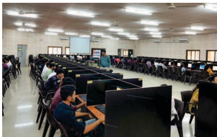
Placement Preliminary exam at CoA, Junagadh conducted by GATL, Vadodara