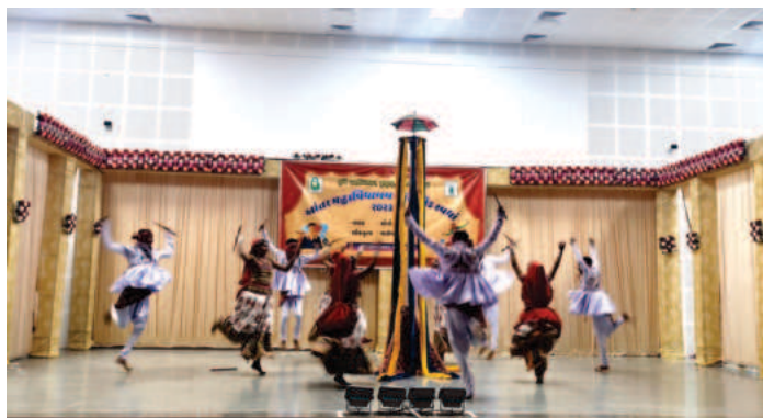
Folk Dance Event