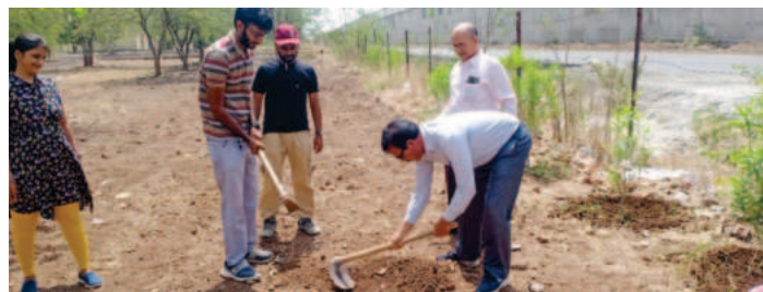
Tree Planation Event