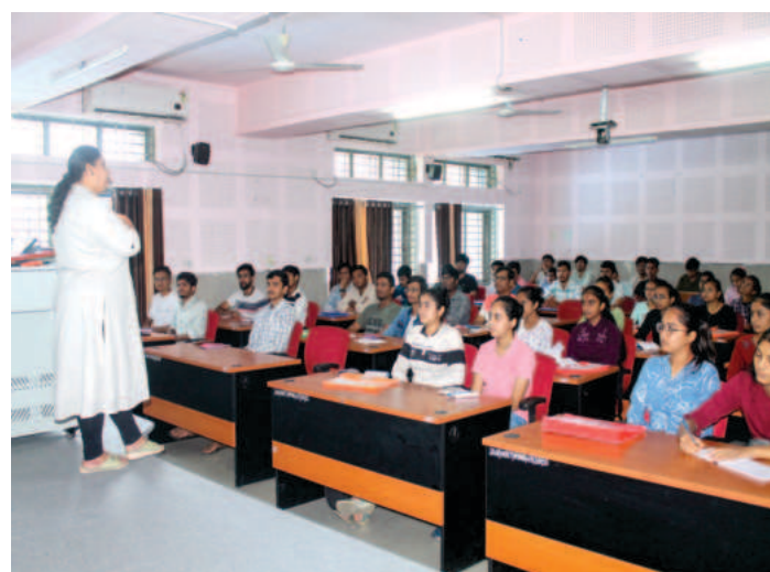
Training on “Unlock Your True Potential”