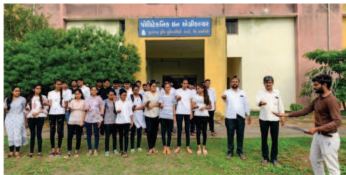
Pledge for “Meri Mitti Mera Desh” Campaign

Meri Mitti Mera Desh Campaign was organized during 09/08/2023 to 15/08/2023. In this programme, different activities like Mitti kalash was sent to Delhi, Pledge Taking, Essay writing competition etc. were conducted.