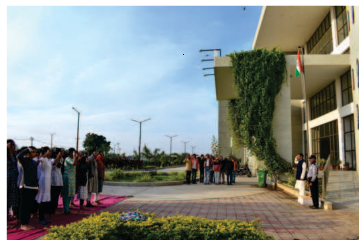
Excerpts from Celebration of Republic Day

Republic Day is a momentous occasion celebrated across India to honour the day when the Constitution of India came into effect on January 26 th , 1950. The Republic Day celebration in 2024 at College of Agriculture JAU Khapat was a testament to the unity, diversity, and resilience of the nation.