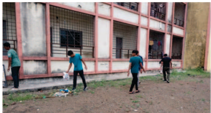
Collection of Waste Plastics around the Boys Hostel

Cleaning of hostel area, Removal of weed, collection of plastic Hostel decoration type of activities where conducted under the Clean India Programme during 16/10/2023 to 18/10/2023 (Three days). One seminar was also organized by polytechnic staff at last Day of this programme.