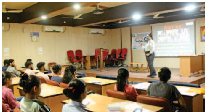
Career Awareness Training

Personality Development in detail that how these things are important for career. In this training, organized by DSW office, around 72 students from College of Horticulture and 94 students from College of Agriculture, JAU, Junagadh were benefitted.