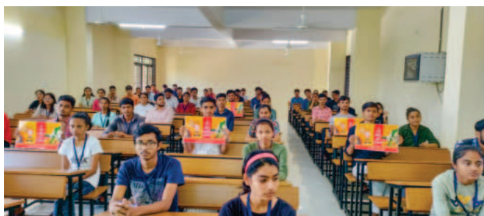
Students attending the programme on 'World No Tobacco Day'