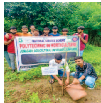
Preparation of “ Amrit Vatika ” by Plantation of Trees by Students