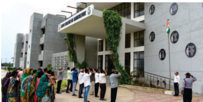
Celebration of Har Ghar Tiranga

Under “Har Ghar Tiranga Campaign” a Tiranga Yatra was organized by COA, JAU, Khapat-Porbandar on 12th August 2023. All the staff members actively participated in the programme and Independence Day was also celebrated at college.