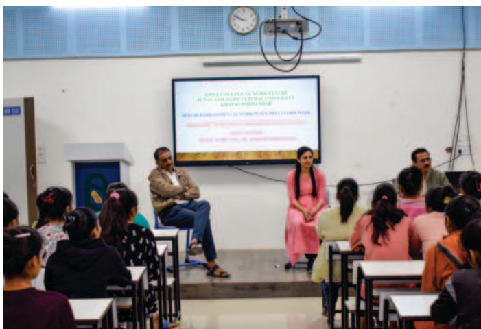
Students attending 'Sexual Harassment Prevention' Seminar