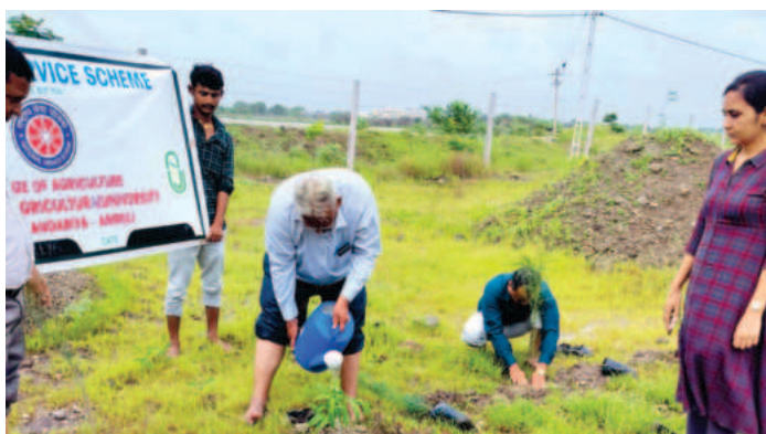
Excerpts from the Tree Plantation Event