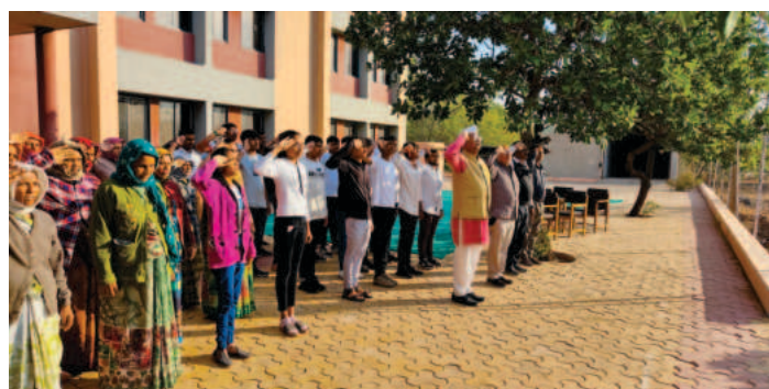
Celebrating Republic Day