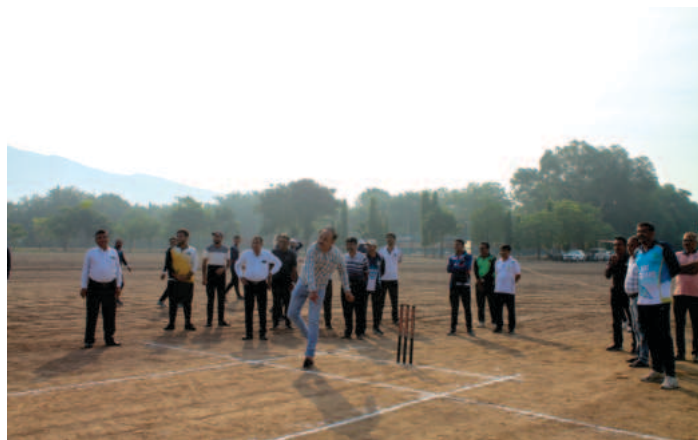
University Staff Cricket Tournament