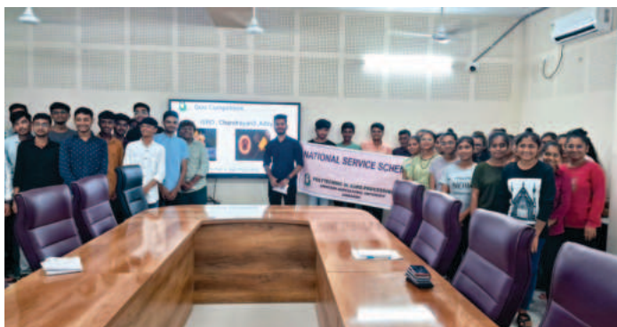
Quiz Competition held in Seminar Hall