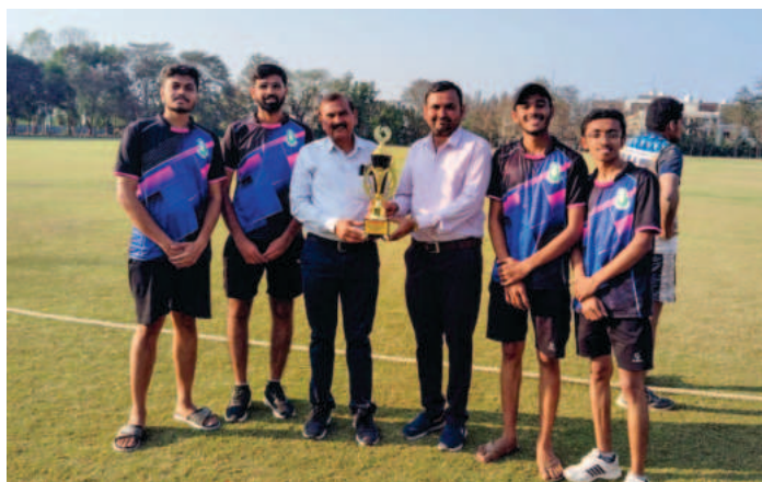
Table Tennis (Boys) Runners-up