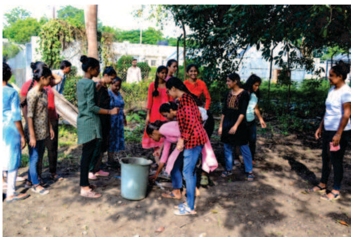
Swachhta Abhiyan at College Campus

Swachhta Abhiyan at college campus was organized in which NSS volunteers of CAET and staff members participated actively.