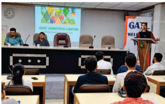
Orientation Programme at CoA, Junagadh by GATL, Vadodara

for the students of all the faculties, so as to build the self-esteem of the students which enable them to face the challenges with confidence