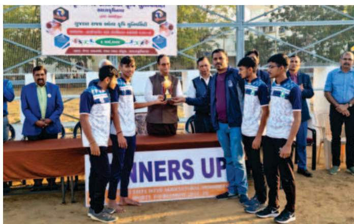
Badminton (Boys) Runners-up