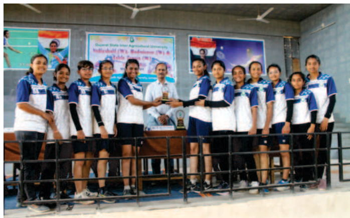
Volleyball (Girls) Runners-up