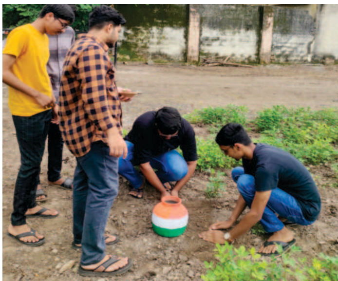
Soil collected by NSS volunteers