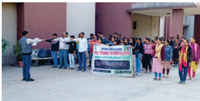
Staff and Students taking Pledge of National Voters' Day