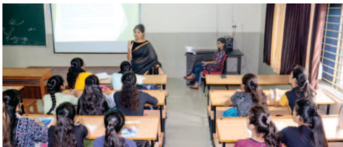
Students on Teachers' Day

society. The competition was a platform to showcase the best teaching practices and inspire pedagogical innovation. At the conclusion of the event, the deserving students were presented with certificates and accolades for their exemplary performance. The event was a resounding success, and it reinforced the importance of recognizing and appreciating the tireless efforts of our teachers.