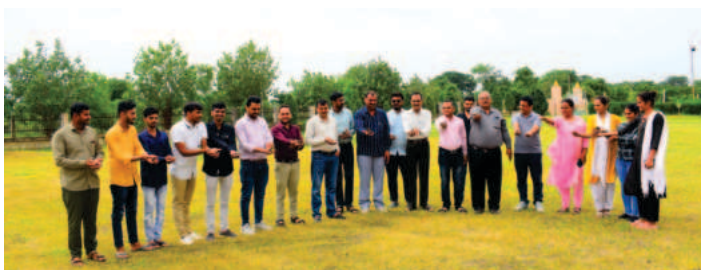
Oath Taking for Meri Mitti Mera Desh

At College of Agriculture, Mota Bhandariya all the staff celebrated the event of Meri Mitti Mera Desh and taken an oath that we will protect the soil from any kind of pollution and as an agriculturist we are taking responsibility that we will work for the improvement of soil fertility and we will maintain the soil health.