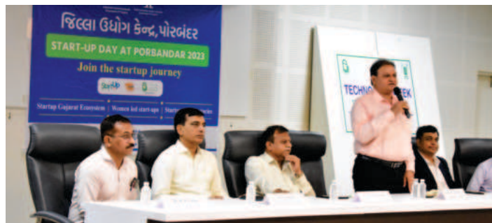
Excerpts from Start-Up Seminar